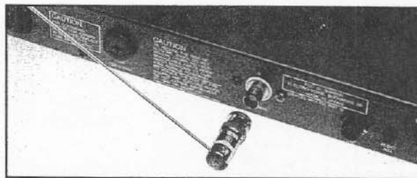
Figure 1 - Connect Antennas on Rear Panel